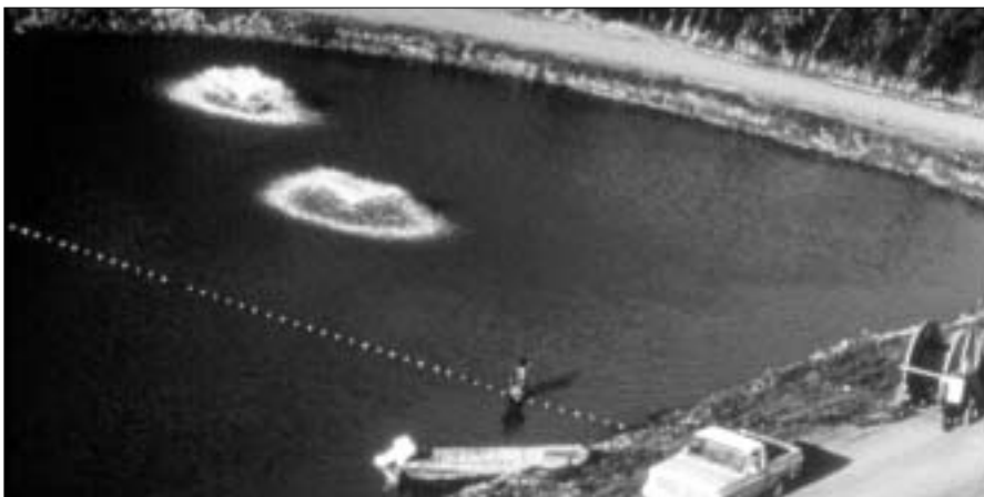
Figure 8. Two vertical pump aerators used in a fish-confinement area.

Electric paddlewheel design was systematically studied by Ahmad and Boyd (1988), who found that the best design consists of a 3-foot diameter paddlewheel with paddles that are triangular (135-degree interior angle) in cross section. Paddles are about 4 to 6 inches wide, with four paddles attached per row and spiraled in a staggered arrangement around the hub. Paddle depth is 4 to 6 inches. Paddlewheel speed should be about 90 rpm. Commercial designs similar to that proposed by Ahmad and Boyd have SAE values of 4.5 to 5.5 pounds O_2 /hp-hour, which is very good for surface aerators.