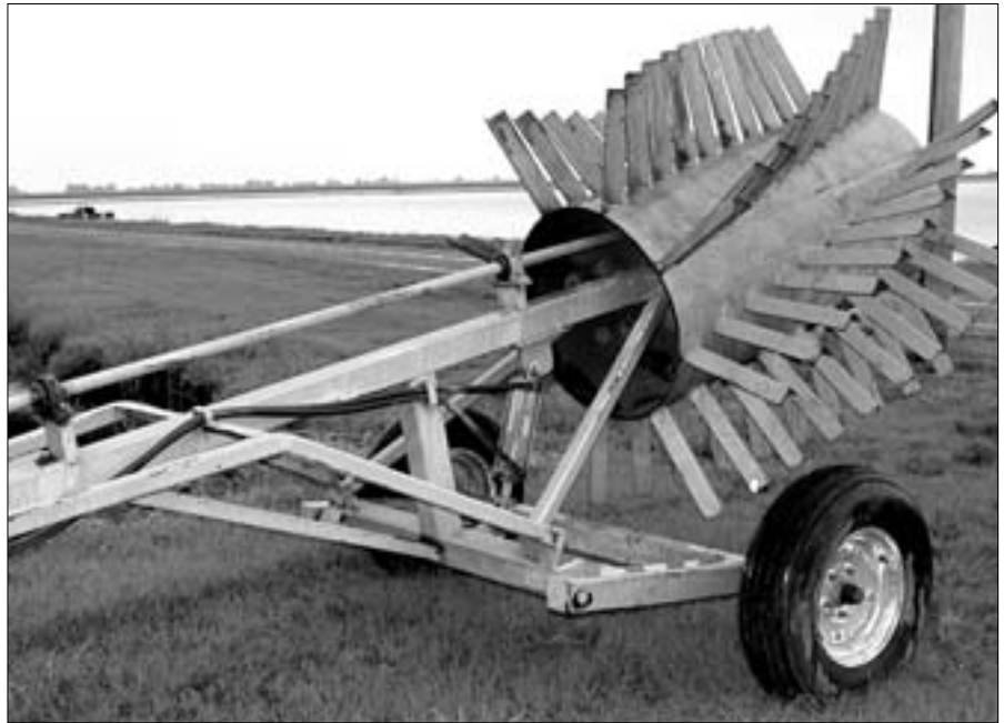
Figure 3. A sidewinder paddlewheel showing the orientation of paddles on the hub.

For routine, everyday use—where efficiency is important—most culturists prefer paddlewheel aerators powered by electric motors (Figs. 5 and 6). Electric paddlewheels used on commercial catfish farms are usually powered by 10- to 15-hp motors and have hubs 10 to 15 feet long. Electric paddlewheels are permanently anchored in each pond and individually controlled by switches on the pond bank. On some commercial aerators the paddle depth can be adjusted for optimum energy use and performance of the motor. The motor should draw about 90 percent of the full load amperage rating to provide maximum oxygen transfer and extend motor life.