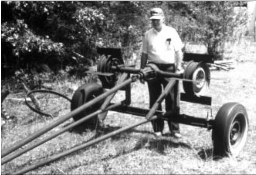
Figure 1. One of the first tractor PTO-powered paddlewheels. The device was fabricated from a truck rear end with rectangular paddles welded to the wheels.

When used at paddle depths of 3 to 6 inches and driven by a trac-