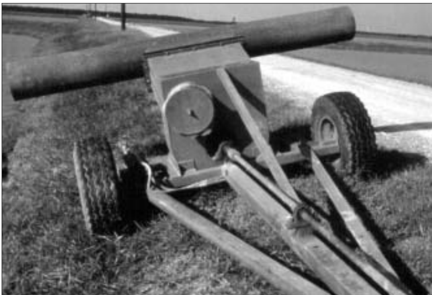
Figure 7. One of the many types of PTO-powered pump-sprayer aerators. A horizontal pipe with a series of outlets has been welded to the discharge of a centrifugal irrigation pump. The device is connected to a tractor PTO and backed into the pond with only the horizontal pipe above the water. When operated, water is sprayed into the air through the holes in the pipe.