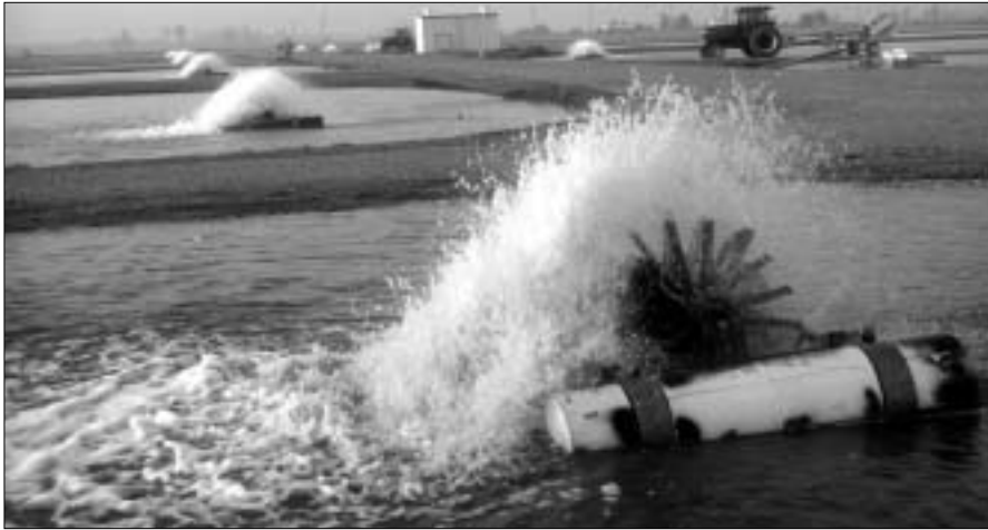
Figure 6. A series of electric paddlewheel aerators in operation.