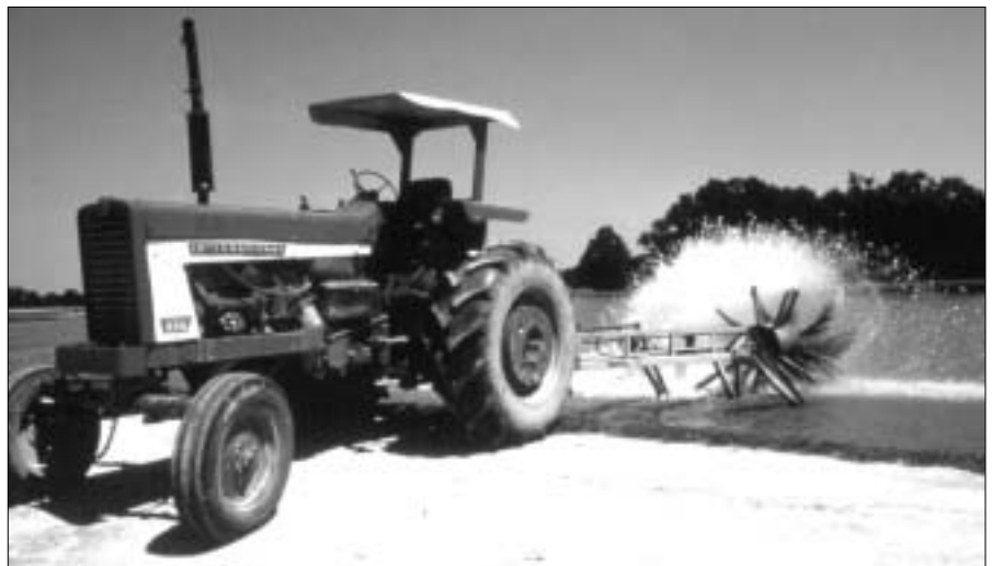
Figure 4. A sidewinder paddlewheel operated in a catfish pond.