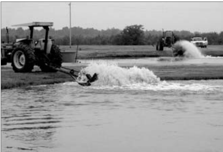
Figure 2. A tractor PTO-powered paddlewheel operated in a catfish pond. A sidewinder paddlewheel is in the background.